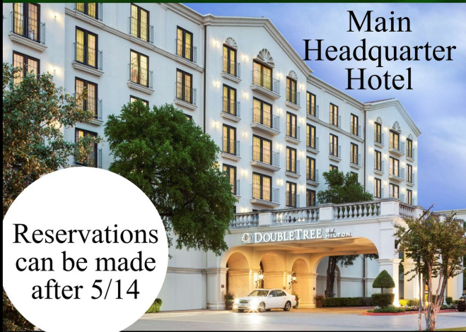
Main Headquarter Hotel